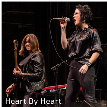
Heart By Heart