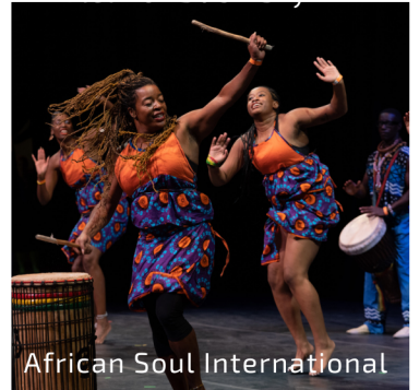
African Soul International